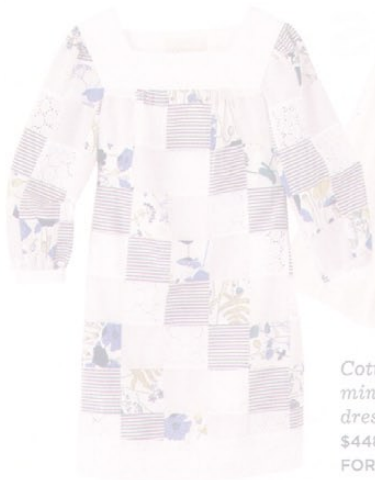
Cotton patchwork minidress $540 and cotton dress with grosgrain belt $448 NEIMANMARCUS.COM FOR STORES

Breezy styles from her spring/summer 2007 line.